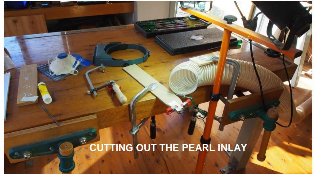
CUTTING OUT THE PEARL INLAY