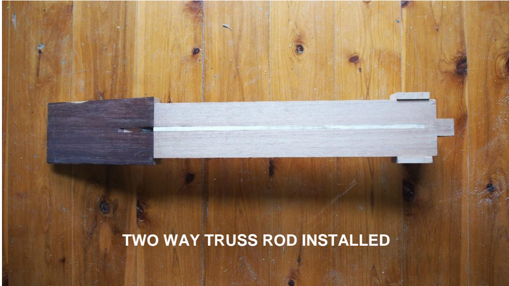
TWO WAY TRUSS ROD INSTALLED