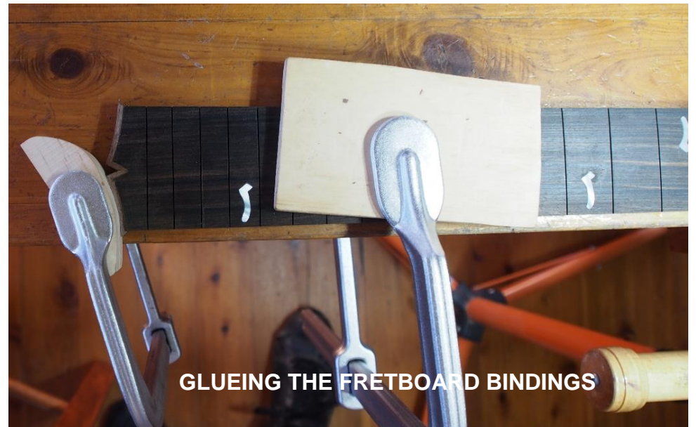
GLUEING THE FRETBOARD BINDINGS