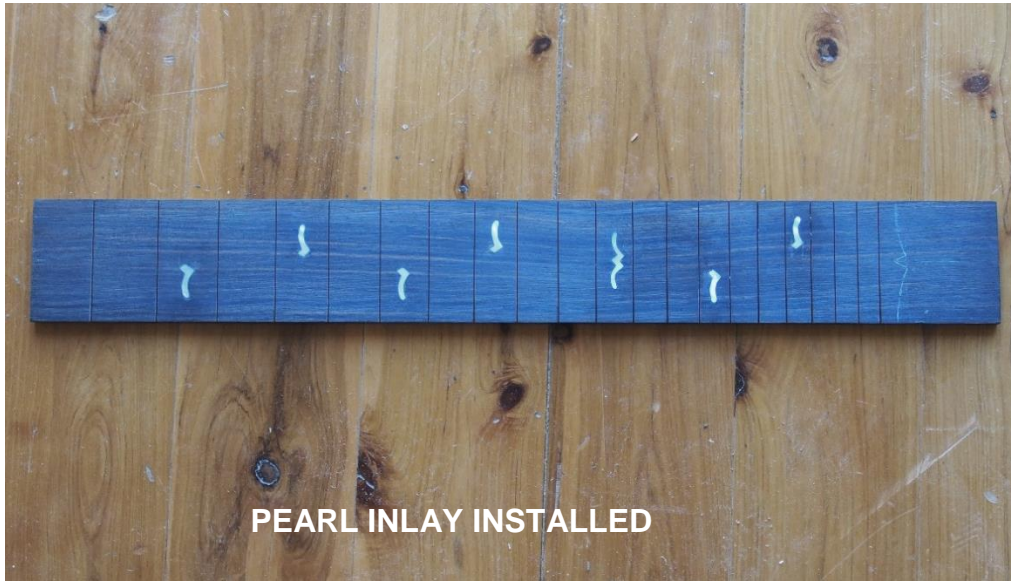
PEARL INLAY INSTALLED