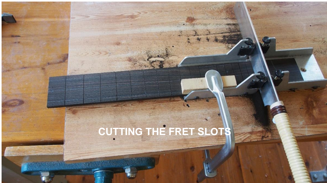
CUTTING THE FRET SLOTS